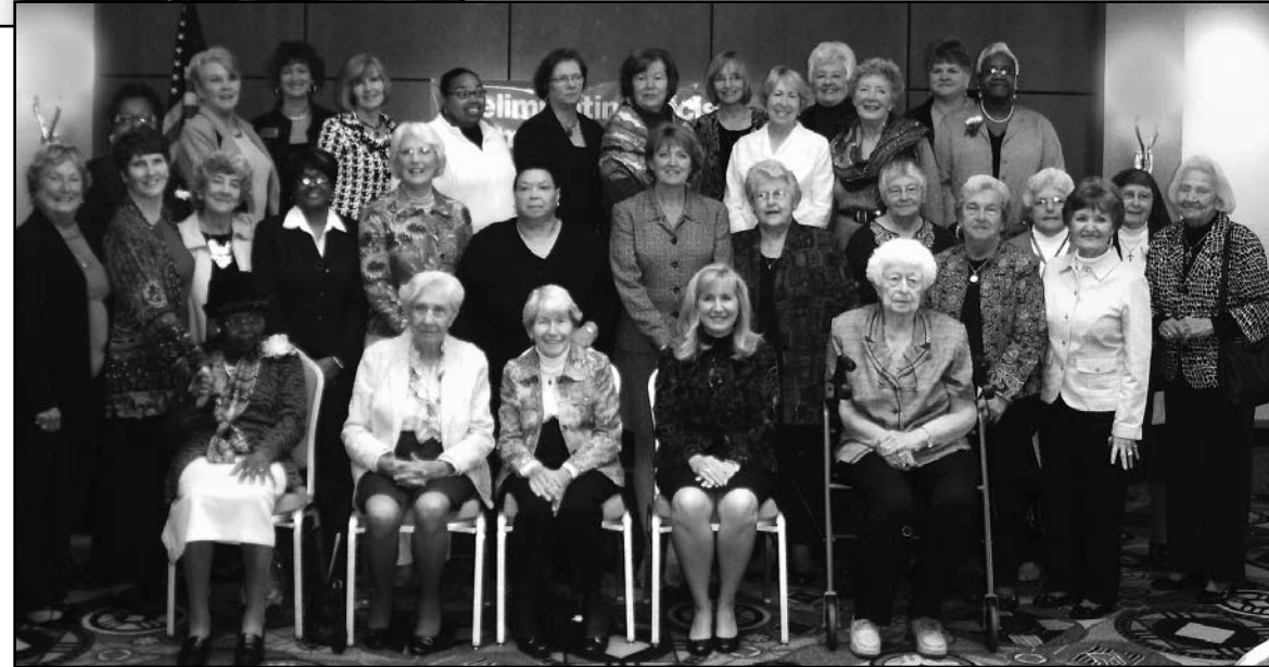
Right: The members of the Academy of Outstanding Women who were in attendance at the luncheon.